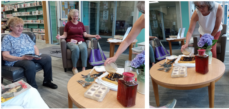
The Afternoon Book Club at Cromwell met on August 17th to discuss their latest book and enjoy some gourmet snacks. The Club meets on the third Thursday of the month at 1pm and will be next reading The Magnificent Lives of Marjorie Post by Alison Pataki.